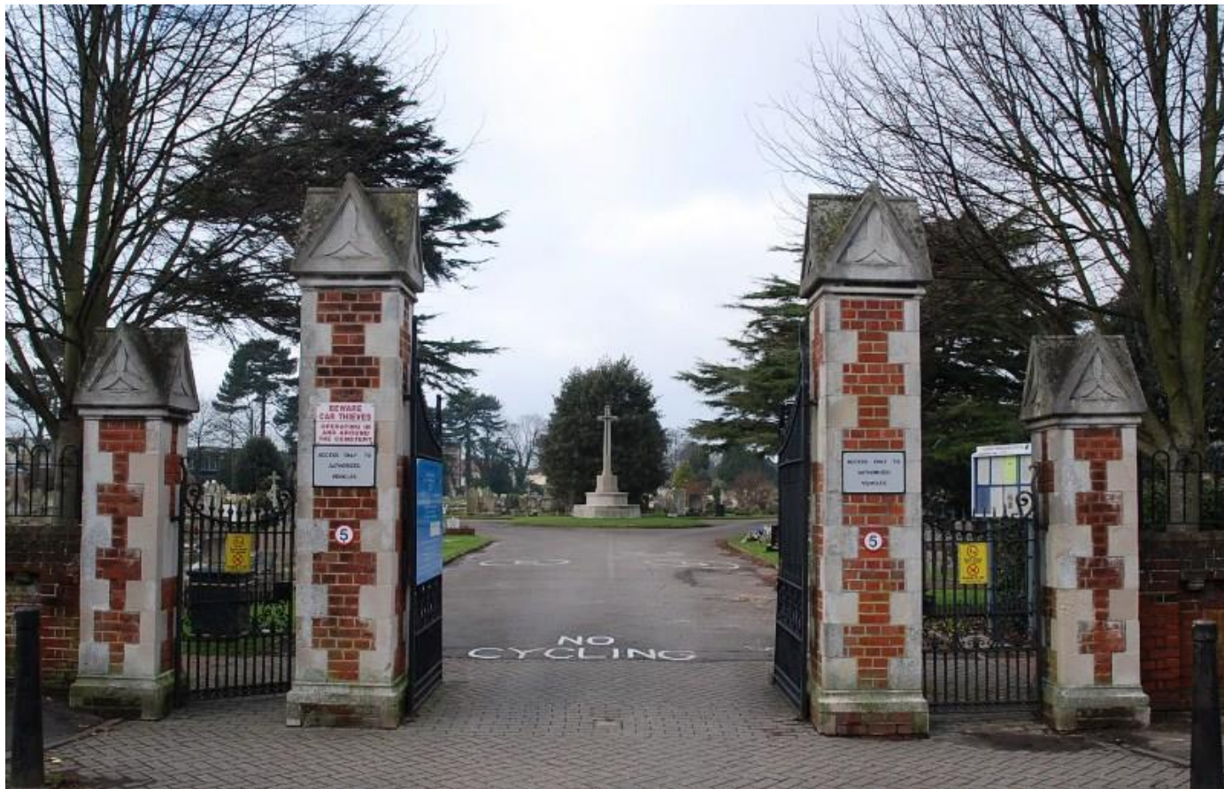
Ann's Hill Cemetery, Gosport, Hampshire